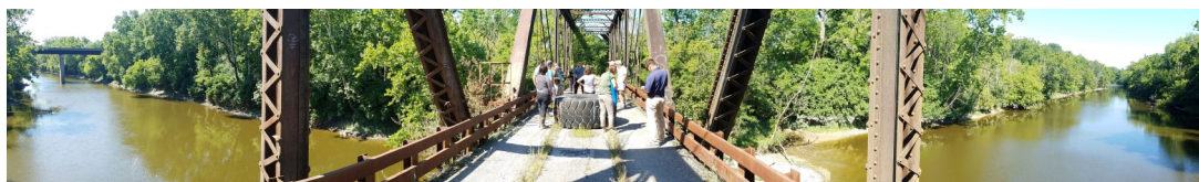
View of the river in future Quarry Trails