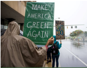
Rise for Climate participants