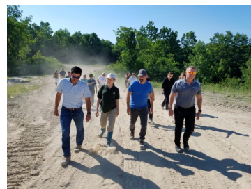
These photos offer a sneak peak of the inactive quarry now owned and soon to be developed by Columbus and Franklin County Metro Parks

Sierra Club is reaching out to developers, asking them to adopt green practices and to include as much green space as possible, not just in the park, but in the private residence area as well.