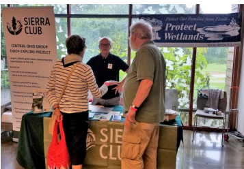
Sierra Club display table — at Scioto Audubon Metro Park .