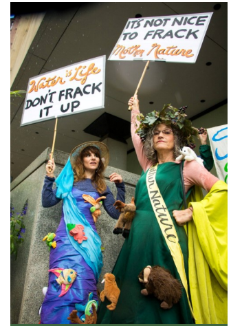
Marchers dressed up as Mother Nature to protest in front of Sen. Rob Portman's office as part of Rise for Climate, Jobs, and Justice on September 8 th

tion and affirmation of all of their citizens.